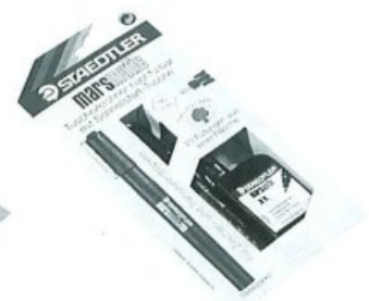
All-card blister package