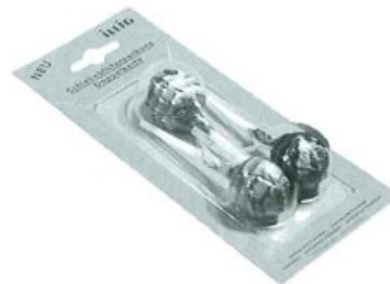
Double-card blister package