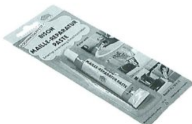
Standard blister package