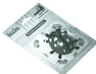
All-plastic blister package