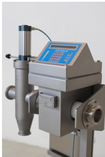
Automatic Reject valve for pipe detector.

For further information please contact: sales@detectronic.dk