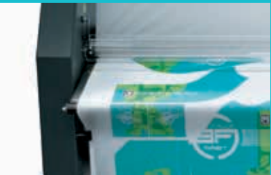
Transfer print at 50 m 2 /hr.

Engineered to keep running costs low and productivity high, the CS-64 uses a digitally regulated, infra-red quartz heating element that consumes far less power than the heated oil alternative. And reaches optimum transfer temperatures much faster. That means less time waiting and more time working. The heat resistant Nomex® feed belt is Kevlar-reinforced to provide a long service life. Mechanically adjusted, it delivers high transfer quality without requiring any operator intervention or compressed air supply. No oil heater. No air compressor. The CS-64 calender is a cleaner, greener heat transfer solution that will save your business time and money.