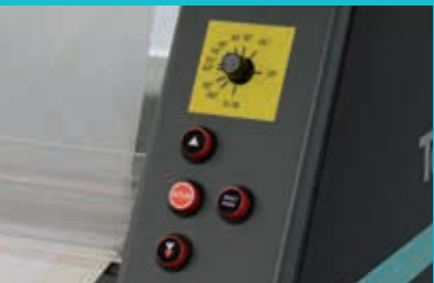
User friendly controls.