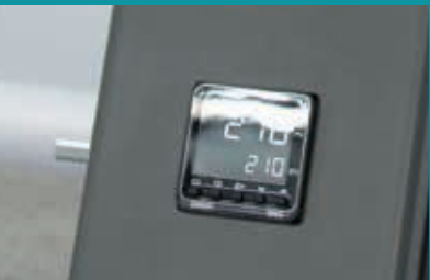
Digitally regulated temperature.