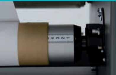
Easy to load.