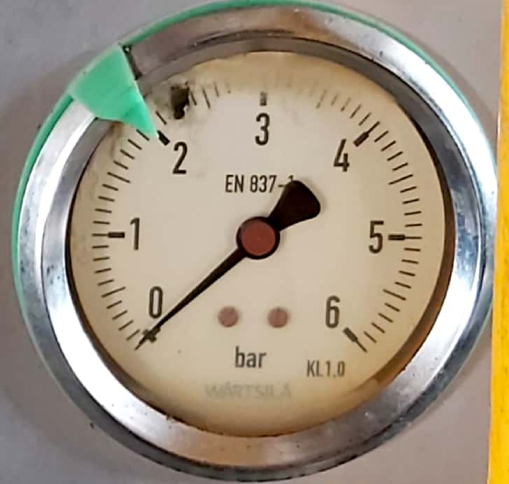
HT - WATER