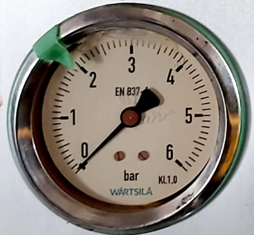
LT - WATER